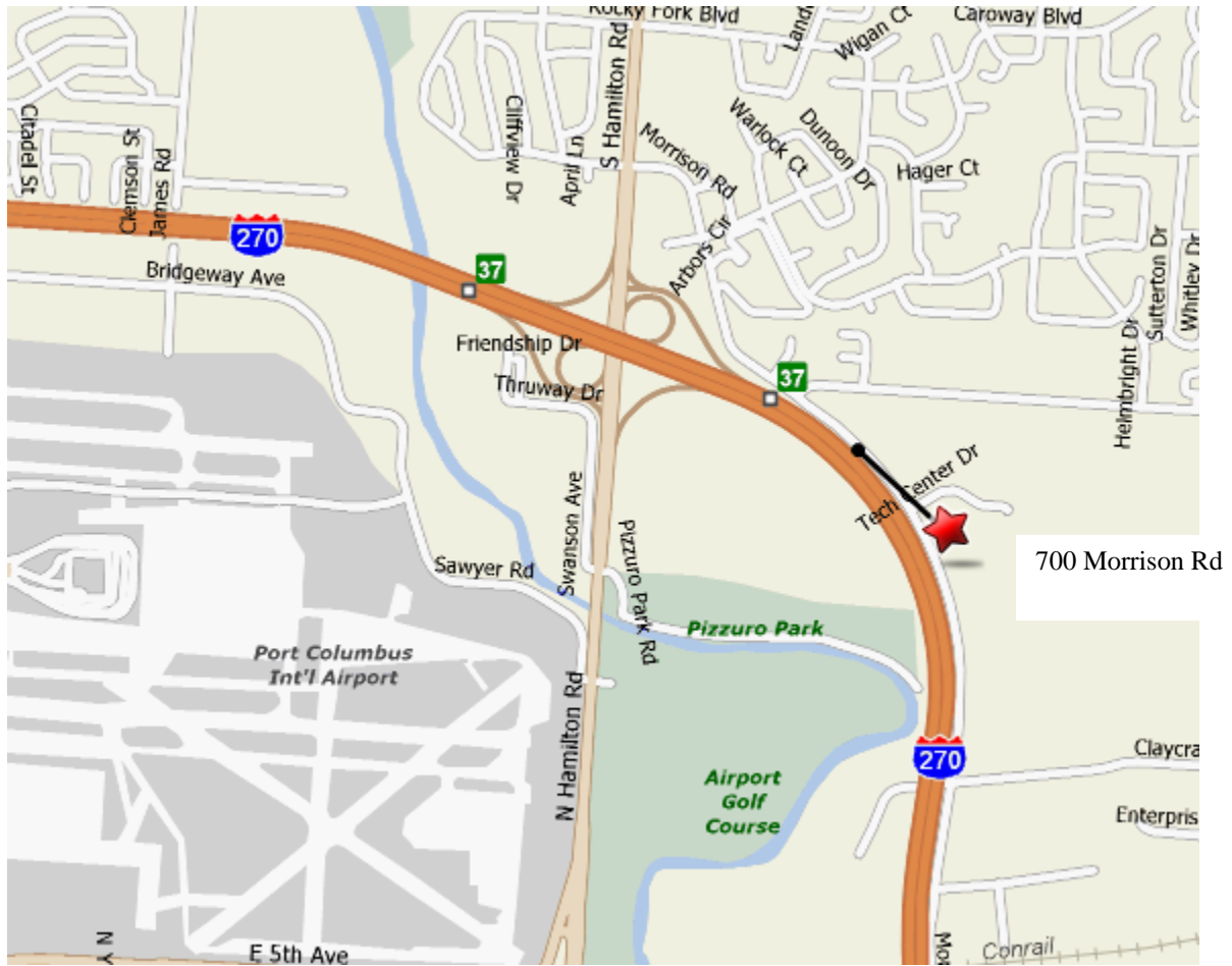
Map 700 Morrison Rd